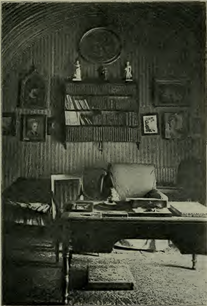
LAMARTINE'S STUDY AT SAINT-POINT